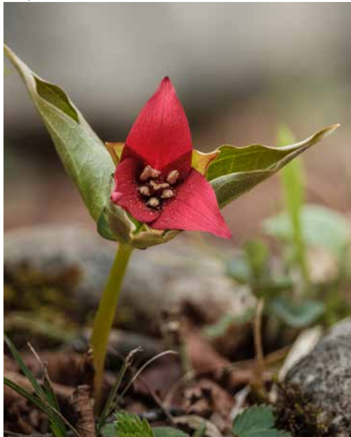
▲ Red Trillium. A spring ephemeral. Fun fact, it smells like a "wet dog" to some!