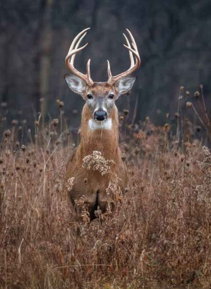
▲ Eastern White-tailed Deer. This is from a chance encounter last fall in Halton's only provincial park, Bronte Creek Provincial Park, and an unforgettable experience.