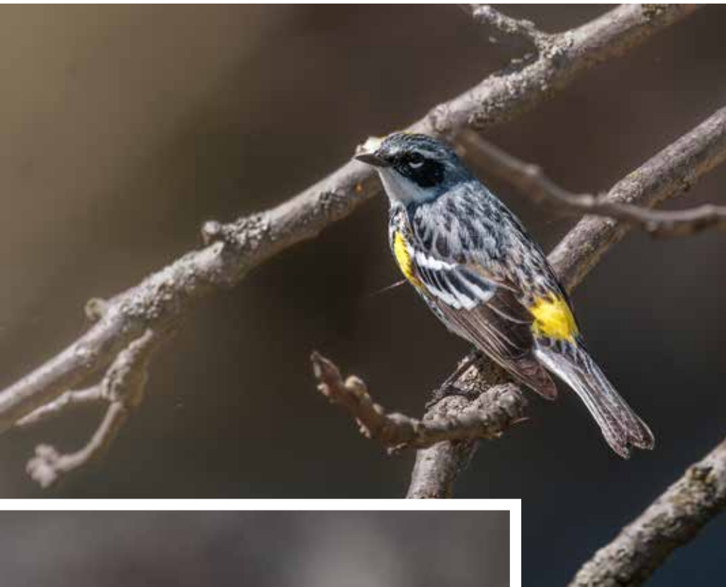
▲ Yellow-rumped Warbler, also known as a Butter Butt.