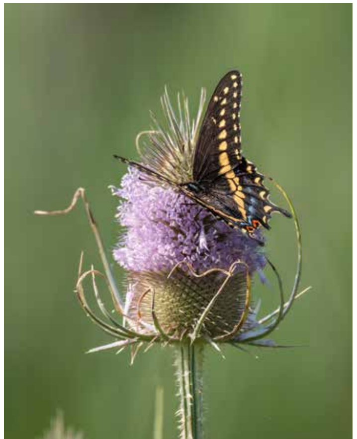
▲ Eastern Black Swallowtail on Teasel.

► Red-tailed Hawk. I had the idea for a photo like this in my mind's eye for a while. A very minimalistic, single perch, a somewhat regal, posed bird of prey, and some dramatic skies behind. Thanks to a chance encounter roadside on a drive home one day, I've now got my shot!