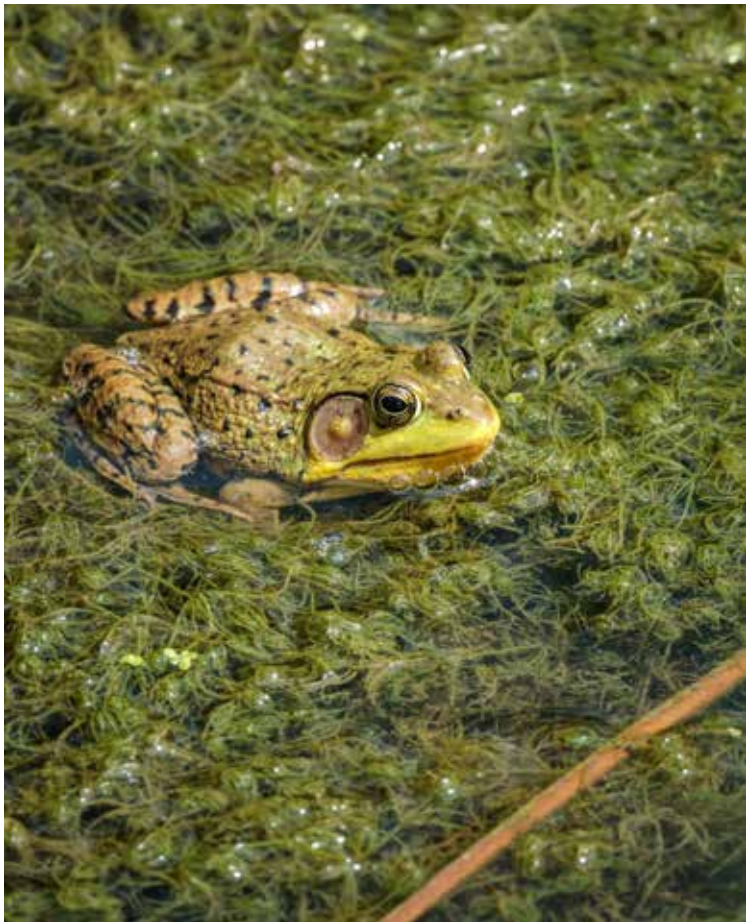
▲ Green Frog with a “bubblebeard”.