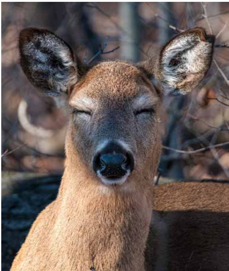
▲ Eastern White-tailed Deer. Doe! [Doh!] I blinked!