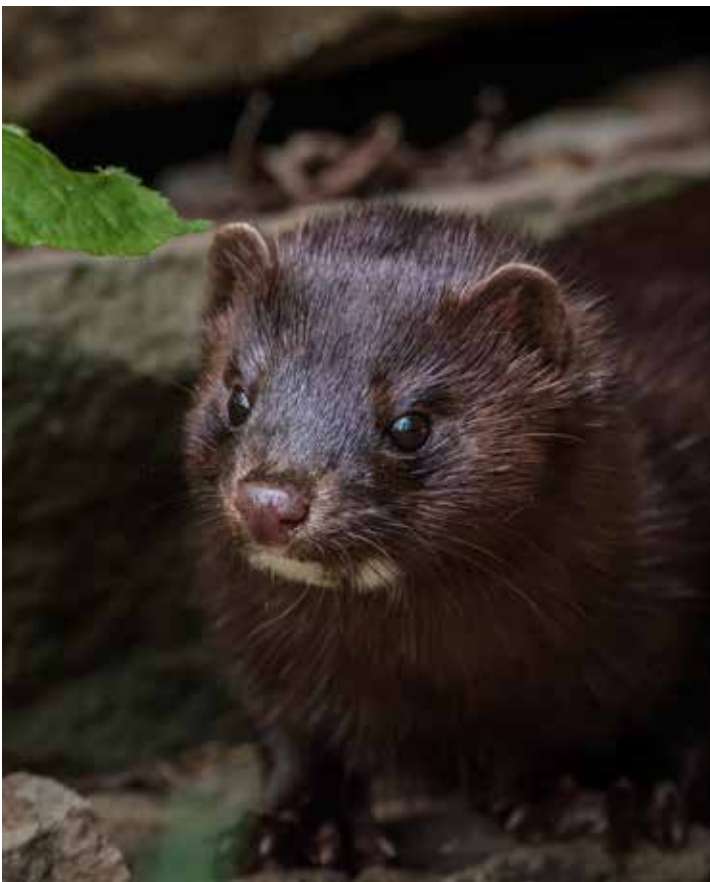
▲ American Mink. While I was sitting by the river passing the time, an American Mink approached me along the riverbank, curious about what I was up to.