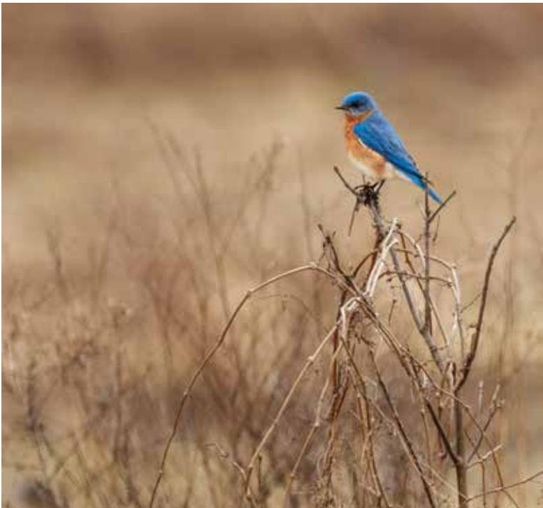
▲ Eastern Bluebird. My personal favourite bird species.