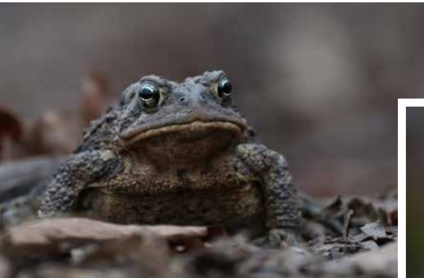
▲ American Toad.