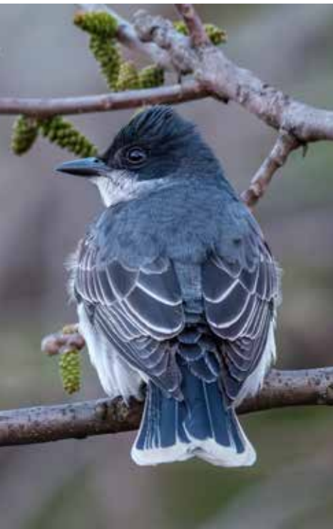
▲ Eastern Kingbird amongst the new spring growth.