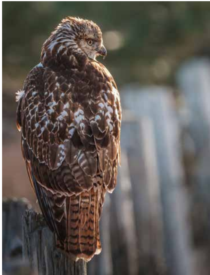
▲ Red-tailed Hawk. After enjoying a meal, this Red-tailed Hawk posed nearby on an old fence.