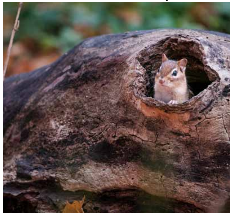
▼ Eastern Chipmunk. An Eastern Chipmunk and I played Peek-a-boo in the late fall of 2023.