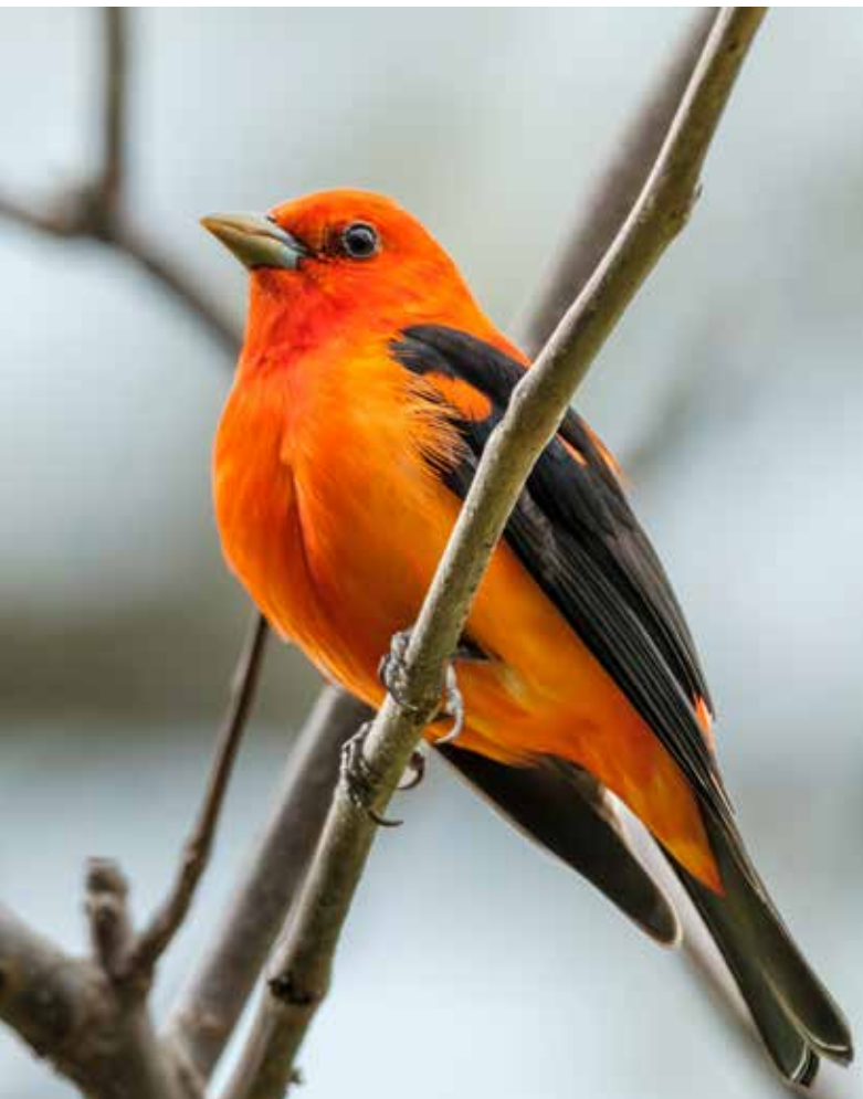
◀ Scarlet Tanager. During an unexpectedly windy, wet, and stormy day, I ventured out not expecting to find anything when this Scarlet Tanager flew past, at eye level, trying to find a break from the storm.