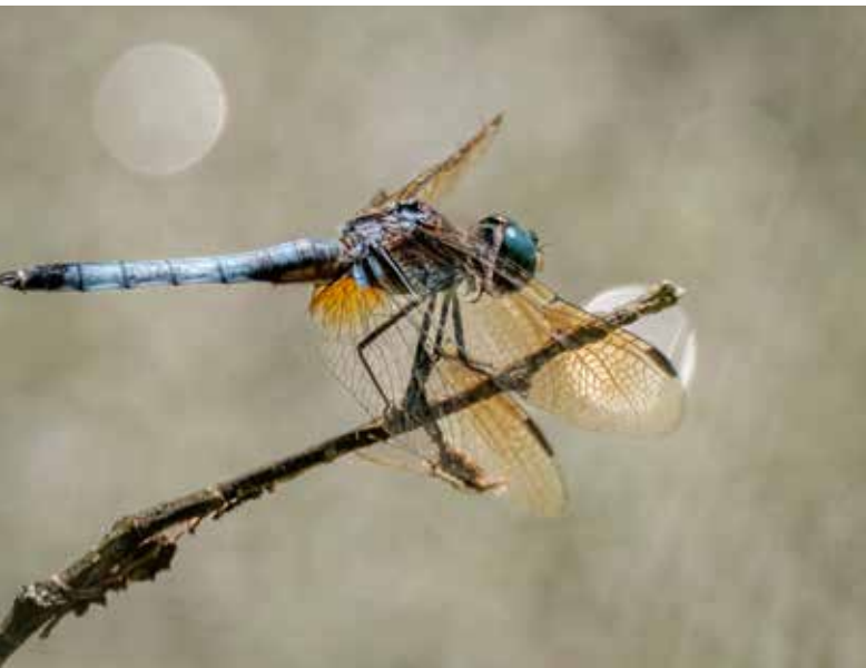
▲ Blue Dasher Dragonfly rests by a pond, a sign of a healthy ecosystem.