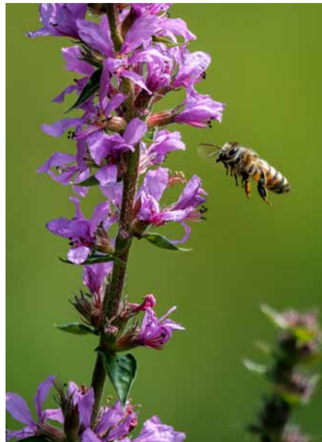
▲ Western Honey Bee at Purple Loosestrife. It took a bit of patience and multiple shots to come away with a shot with the bee looking at the camera, but it was worth the wait.

I'm a nature photographer from Halton Hills. As an outdoor enthusiast, I'm always looking for ways to immerse myself in the natural world, and photography has been the perfect medium for me to do so. Photography for me is a way to connect with nature, explore new places, and see the world through a different lens. Living along the Niagara Escarpment and having the Bruce Trail in my back yard has been a blessing. I'm constantly inspired by its beauty and complexity, and I'm grateful for the chance to share my perspective with others. Whether it's a grand landscape or the details of a bird's feathers, I believe everything in the natural world has its own story to tell, and it's my job as a photographer to bring those stories to life.